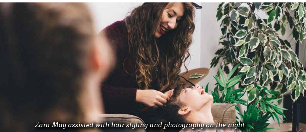
Zara May assisted with hair styling and photography on the night