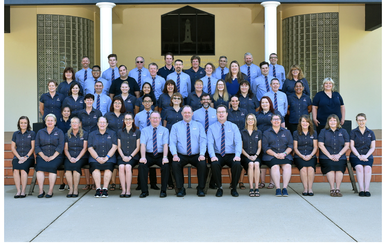
SCHOOL STAFF 2019