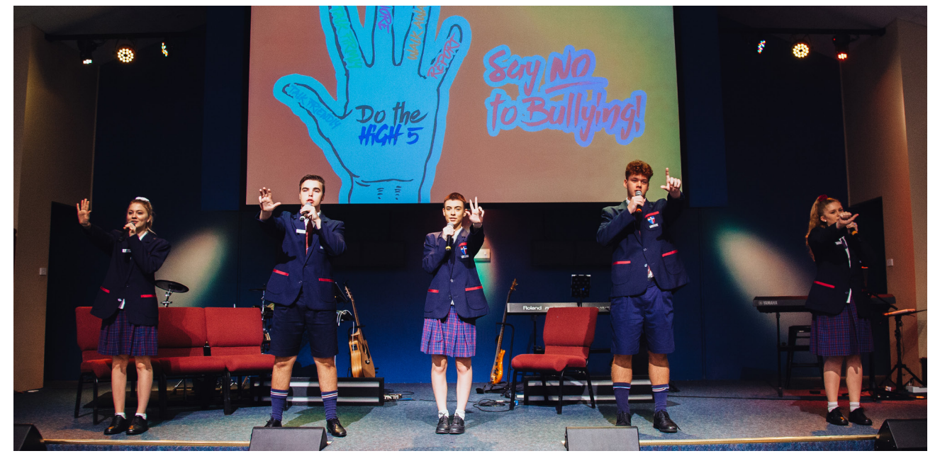
NATIONAL DAY OF ACTION AGAINST BULLYING

Please refer to the My School website and click the link for information relating to this. <a href="http://www.myschool.edu.au/">http://www.myschool.edu.au/</a>