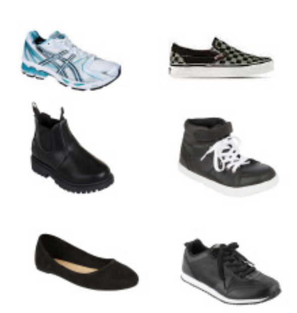
Shoes - NO

• STACEY by Everflex (Spendless Shoes RRP $33.99)